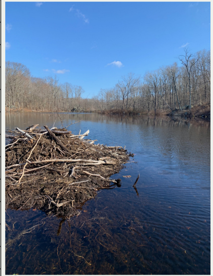
Hartman Park, Lyme (#31)