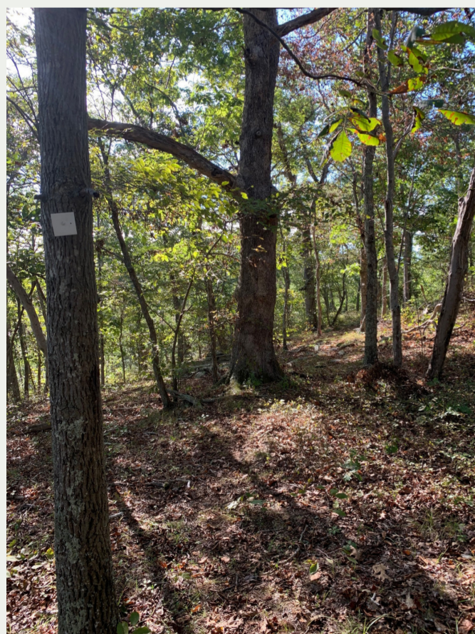
Johnston Preserve, Lyme (#15)