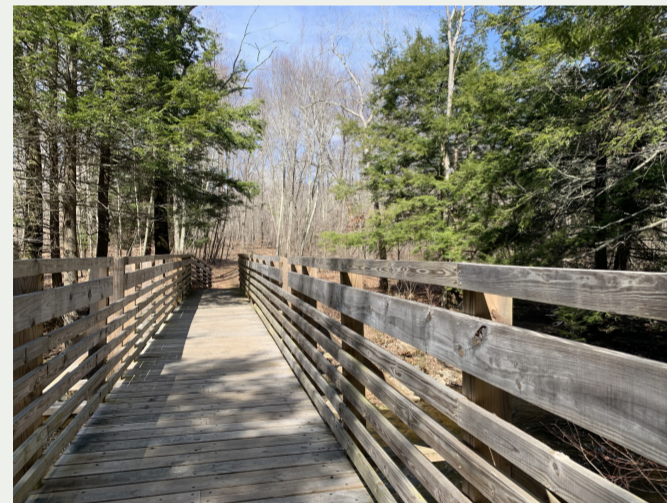
Patrell Preserve, East Haddam (#11)