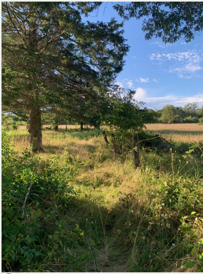
Burnham Brook Preserve, East Haddam (#6)