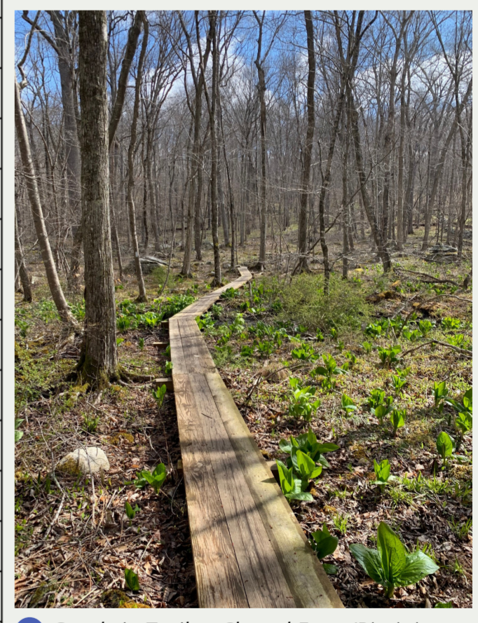
Goodwin Trail at Chapal Farm/Pizzini Reserve, East Haddam (#12)