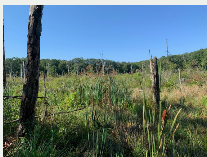
Woodland Warbler Preserve, Salem (#38)