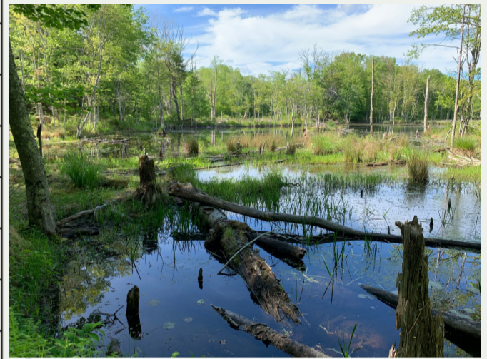
Walden Preserve, Salem (#36)