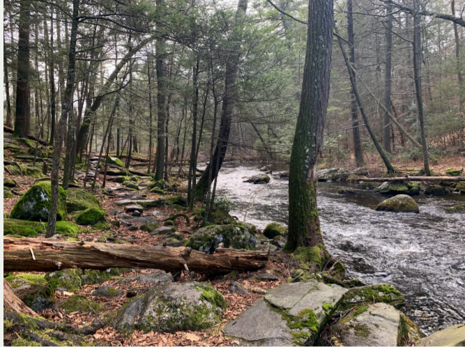
Devis Hopyard State Park, East Haddam (#5)